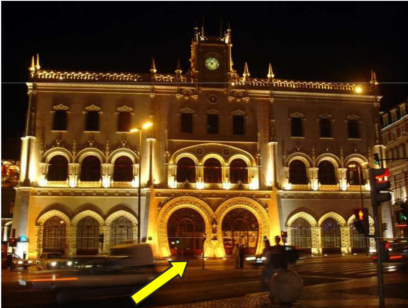
Central hall of Rossio Railway Station Ground floor Time: 19:35 to 19:45